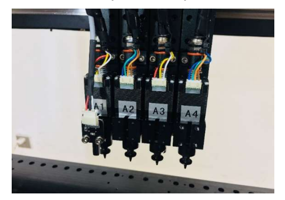
New Z-axis sensor included to measure pickup height

Company registration number: 91330381MA285PEJ8R, Address: 202 B,Nan Bingjiang Building, Xinfeng Village, Feiyun Town, Rui'an City, Wenzhou City, Zhejiang Province, China 365207