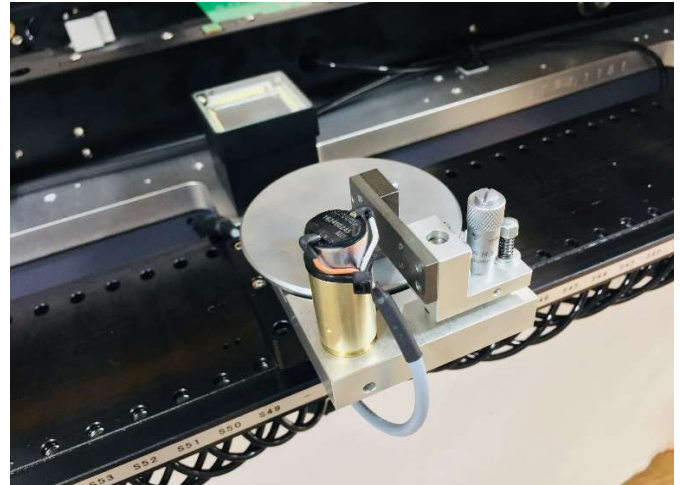
Optional dipping station

SMEMA compatible connectors for synchronisation on input and output side!